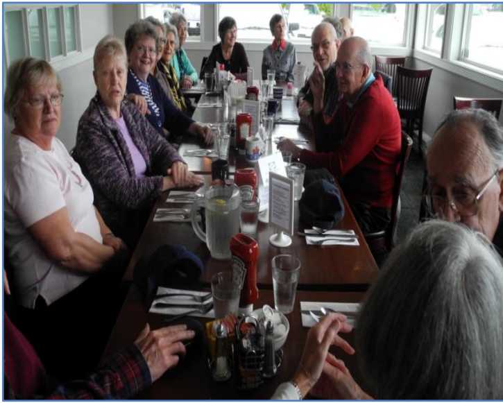
This is the Pensioners' group at White Rock on October 17, 2013.